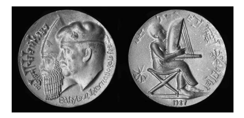
Fig. 6 | Medal showing Saddam Hussein with Nebuchadnezzar issued to commemorate the First Babylon International Festival in 1987.