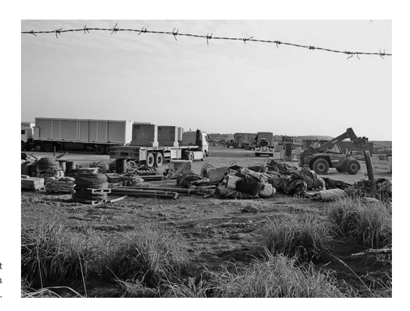
Fig. 9 | The military camp at Babylon being dismantled in December 2004 (J. E. Curtis).