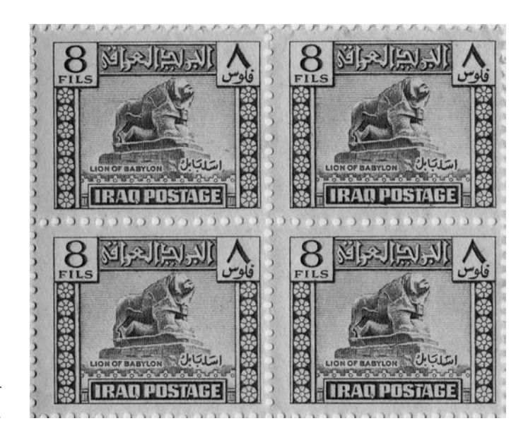
Fig. 3 | 8-fils stamp showing the Lion of Babylon, first issued 1943 (J. E. Curtis).

lored glazed bricks with representations of bulls, lion and dragons (Fig. 4). The upper part of the gate had in fact been found in thousands of fragments which were taken to Berlin and painstakingly restored to produce the monument that is now visible in the Vorderasiatisches Museum. In spite of these welcome innovations at the site itself, however, Babylon still remained a disappointment for most visitors.