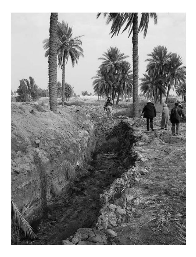
Fig. 10 \mid A military trench just outside the southern boundary of the Babylon camp (J. E. Curtis).