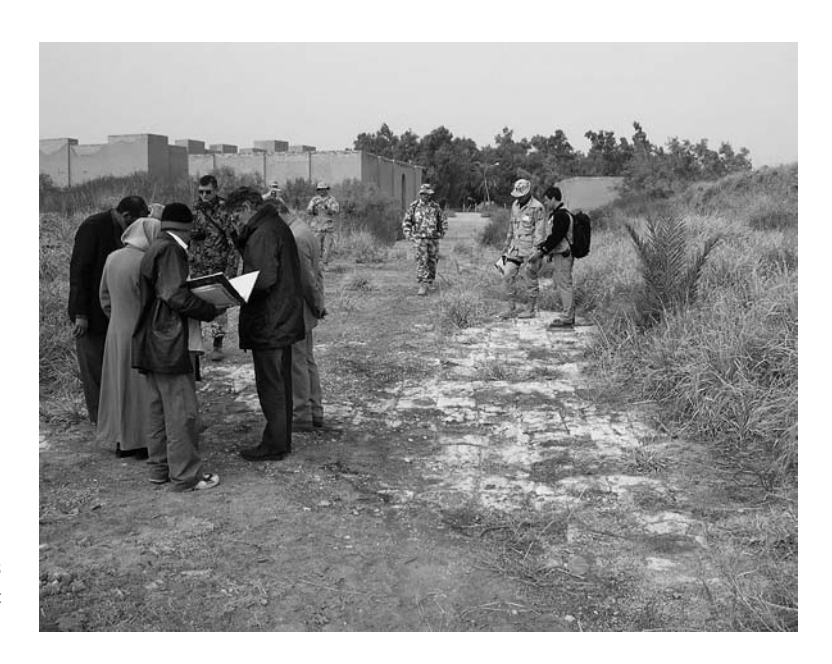
Fig. 15 | Broken paving-slabs along the Processional Way at Babylon (J. E. Curtis).