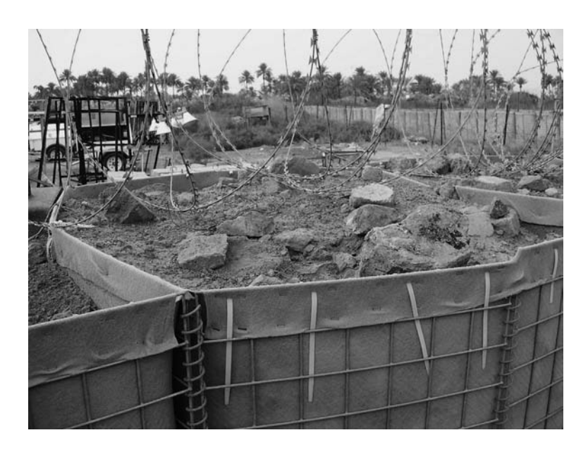
Fig. 14 | HESCO containers at Babylon filled with archaeological deposits (J. E. Curtis).

ological remains. So, some of the HESCO containers will have been filled with archaeological deposits from outside Babylon, and when the containers disintegrate as they are deigned to do (they are biodegradable) the contents will spill out contaminating the archaeological record at Babylon. Another problem is related to the driving of heavy military vehicles around the site. In many places wheel-marks and signs of surface disturbance were visible, but it is not usually clear how much damage this might have caused to the fragile archaeological deposits beneath. In one instance, however, it is painfully obvious. This is in the north part of the famous Processional Way, where original paving slabs have been broken by military vehicles which should never have been driven along this street (Fig. 15).