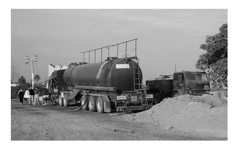
Fig. 12 | The 'fuel farm' at Babylon (J. E. Curtis).