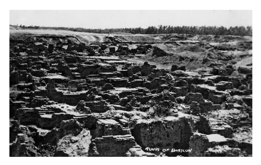
Fig. 1 | Postcard showing the 'Ruins of Babylon', 1932 (J. E. Curtis).