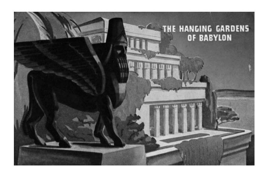
Fig. 2 | Colored postcard featuring 'The Hanging Gardens of Babylon', c. 1935 (J. E. Curtis).