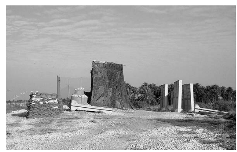
Fig. 13 | Sandbags, HESCO containers and concrete T-walls at Babylon.

the vicinity of the gates, there were still in December 2004 large numbers of HESCO containers (Fig. 13).