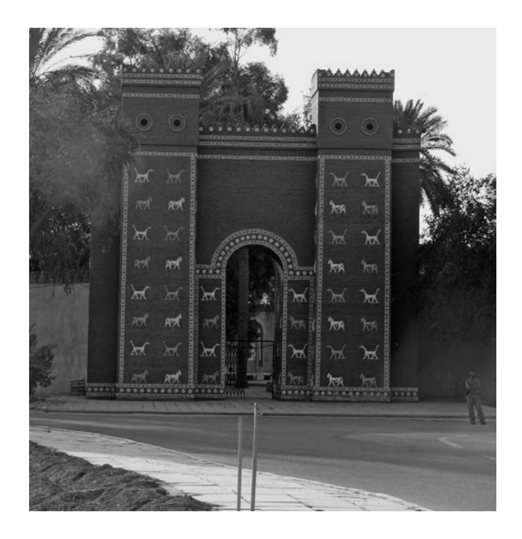
Fig. 4 | Half-sized replica of the Ishtar Gate in the centre of Babylon (J. E. Curtis).