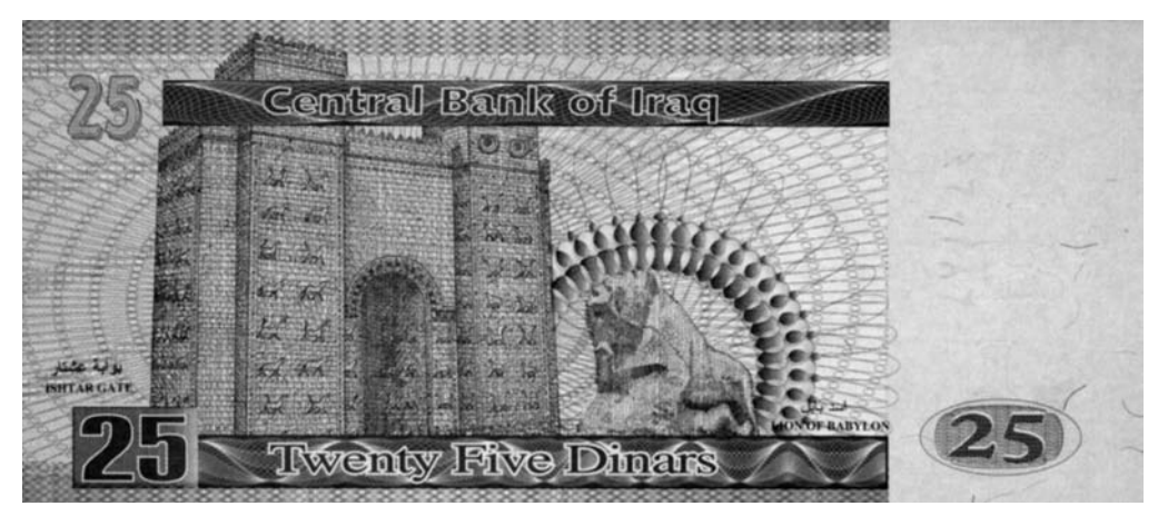
Fig. 7 | 25-dinar banknote issued in 2001 showing the Ishtar Gate and the Lion of Babylon (J. E. Curtis).

The first phase of the reconstruction project was mostly finished in time for the First Babylon International Festival in September 1987. This was a lavish event lasting for a month and featured music and dance by performers from about 30 different countries. In the promotional literature issued by the Festival Committee, Saddam Hussein was compared with great figures from Babylonian history like Hammurabi and Nebuchadnezzar II, and a special medal was issued showing the profiled portrait of Saddam Hussein overlapping that of Nebuchadnezzar II (Fig. 6).