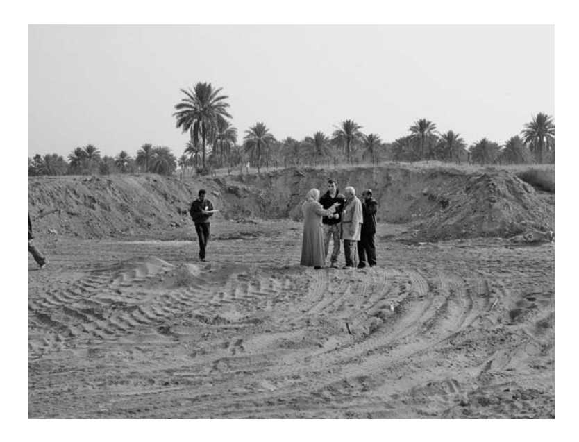
Fig. 11 | A military "cutting" at Babylon involving the removal of topsoil (J. E. Curtis).

It was just beyond the line of barbed wire marking the southern boundary of the camp, quite close to the site of the ancient ziggurat Etemenanki. The purpose of this ditch was apparently defensive, to prevent vehicles from driving right up to the wire. Thrown up on the sides of the trench were piles of earth containing pottery (potsherds and at least one complete pottery vessel), bones and fragments of brick with inscriptions of Nebuchadnezzar II Then, there were about 14 'cuttings', areas where topsoil had been removed, probably by a mechanical shovel, sometimes to a depth of 6 m (Fig. 11).